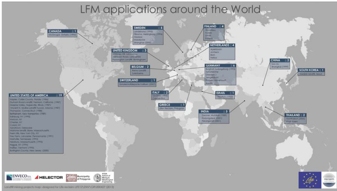
Fig. 3. World atlas of landfill mining projects