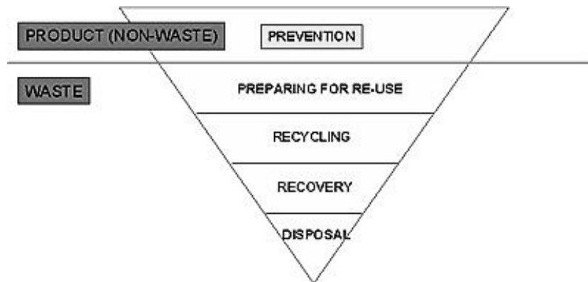
Fig. 1 The waste hierarchy according to the WFD 2008/98/EC